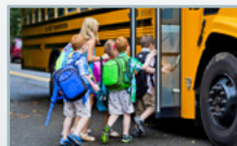
Daycare & Pre-School Childcare Liability