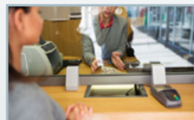
Financial Institutions SIPC/Federal Requirements