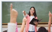
Classrooms, Counseling and Interview Rooms State & Federal Regulations