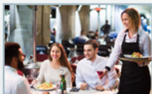
Restaurant & Retail Theft, Public Safety, Slip & Fall Lawsuits