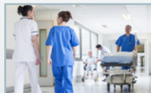
Hospital & Nursing Homes Patient Safety & Privacy Regulations