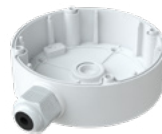
Junction Box for Fixed Dome Cameras