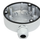
Junction Box For Varifocal Dome Cameras