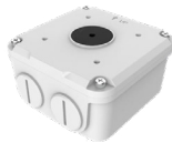
Junction Box for Bullet Cameras