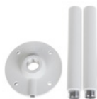
Pendant Mount for Junction Box

Alibi Cloud VS is a cost-effective video surveillance solution that allows you to stream and retain video surveillance footage in an ultra-secure cloud environment. Powered by Eagle Eye Networks, a global leader in cloud video surveillance, Alibi Cloud VS is engineered to deliver cutting-edge reliability, scalability, and cyber-security.