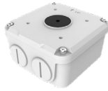
Junction Box for Bullet Cameras