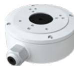
Round Junction Box